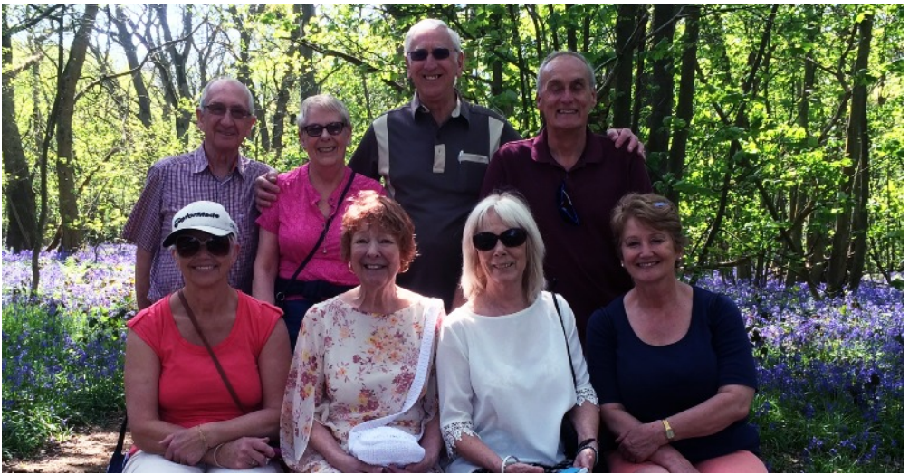
Those who looked for a Place2Go - and went