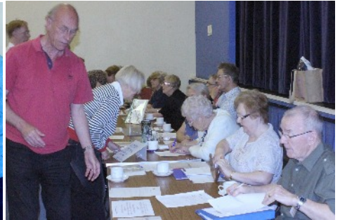
Recording interest in various groups and activities