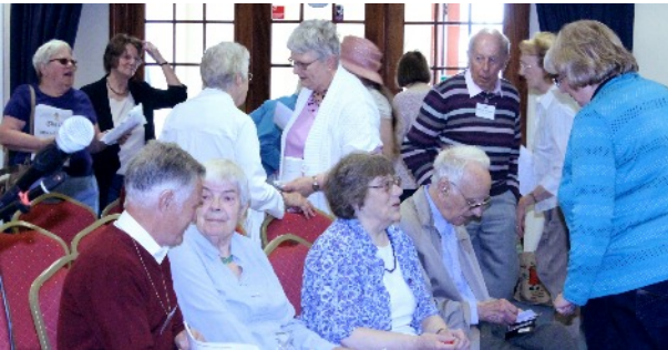
Meeting and greeting. Old faces, new faces.