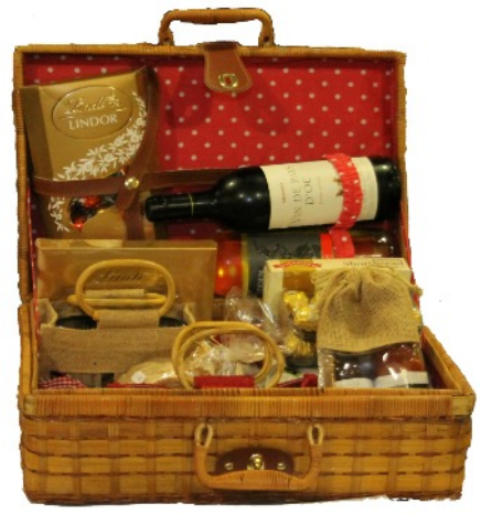
The raffle prize won at the December meeting