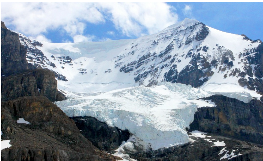
A touch of Winter from the Photographic Group. This photograph, taken in June, is of part of the Athabasca Icefield on the border between Alberta and British Columbia, Canada.

The Chairman and Committee of Thrapston and District U3A wish you and your families a very merry Christmas and/or Winterfest, as you prefer, and a happy and prosperous new year.