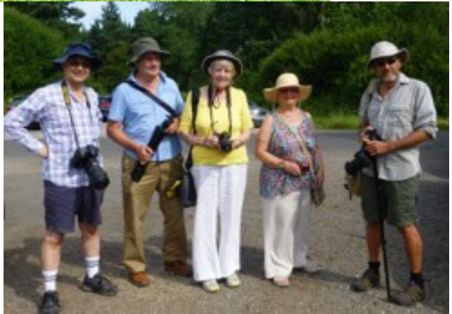
Right - The Photo Group searching hard for purple emperors.