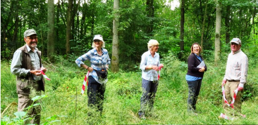
Above - The Woodland Wellbeing Group after conducting a census of oak, field maple and ash trees in Oxlip Wood.

Woodland Wellbeing - For a blissful relaxing and informative morning try a few hours in a Sudborough wood courtesy of Outdoor Tribe. This new and interesting venture will surely become a resounding hit with anyone who enjoys communing with nature. From weeding saplings to counting trees, to hacking brambles (very satisfying). The possibilities are endless. I can guarantee you will come away feeling inspired. Jane Stokes